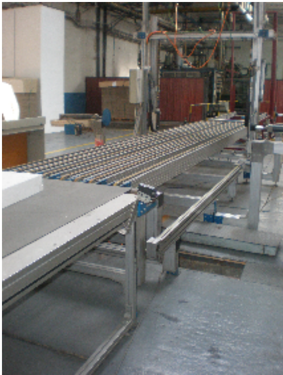
Fig. 1. Partial view on the contour cutter