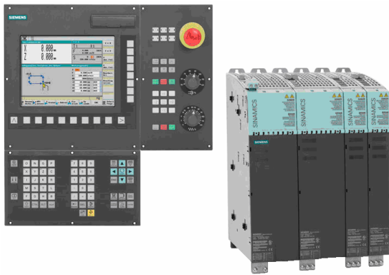
Fig. 2. SINUMERIK 802D sl with peripheries and SINAMICS S120 motor modules